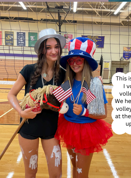
This is a picture of my friend and I volunteering to help run a volleyball camp at our school. We helped the kids learn skills for volleyball and had a tournament at the end where we had to dress up according to a theme.