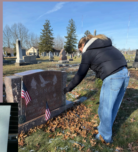
Wreaths across America is an organization that provides wreaths for veterans' graves during the holidays. I was able to be a part of this and I helped put the wreaths on the graves and saying the names of the veterans to thank them for their service.