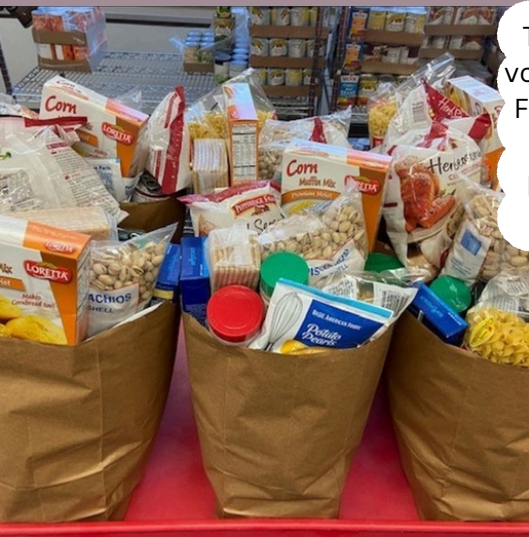
This picture is from when I volunteered at the Cleveland Food Bank, helping package nonperishable food for people in need during the holidays.