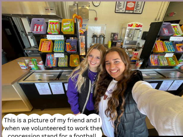
This is a picture of my friend and I when we volunteered to work the concession stand for a football game at the local stadium. We prepared the food, served customers, as well as cleaning up the stands afterwards.