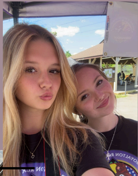
This picture is of my sister and I volunteering to help run a local softball tournament. We helped teams check in, directed them to the fields, and took pictures.