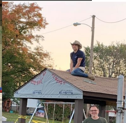
The Boy Scouts of America is largely based on volunteer work around the community. This allows us to grow our community's awareness of who the Boy Scouts are and what we do. We visited cemeteries and raised veteran flags for those who served in past wars. We also participated in color guard and flag ceremonies at veteran day parades and other holidays. Food drives before major holidays were also very important. My own volunteer oriented Eagle Scout Project was renovating Mylo Park which is in the neighborhood where I grew up.