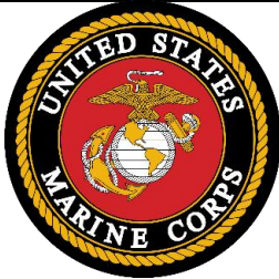
I was honored to be selected as the Eagle Scout Volunteer speaker at the Annual Boy Scout Fundraiser held at the Pasquerilla Conference Center in Johnstown PA. This enabled me to share my experience of how becoming an Eagle Scout impacted my experience in the Marine Corps and enhanced my life.