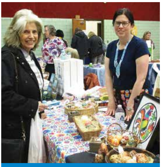
One of the many vendors at the Eggstravaganza.