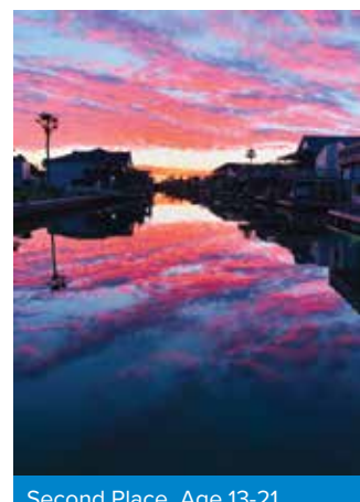
Galveston, TX-A beautiful sunset while in Galveston.