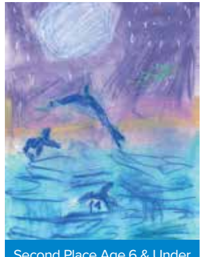
Second Place Age 6 & Under Genevieve Revilak, West Mifflin, PA L 8344

"Sunset Boardwalk" at Myrtle Beach, SC. The beautiful long boardwalk leading up to the ocean.