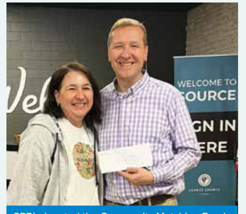
CPRL donated the Community Matching Funds to different organizations. One distribution of the check donation was to Source Church of Pittsburgh for their vacation bible school summer program.

CPRL plans to do this again next year to a hopefully bigger crowd. Please consider giving up 3 hours of your day to help this worthy cause and to feel fulfilled and inspired.