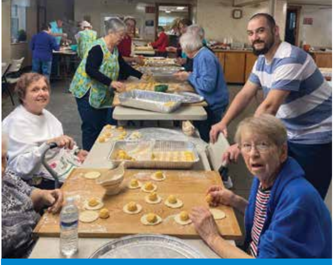
Lodge members and parishioners work together making pirohi.

Lodge 62, parishioners and a few friends from Ss. Peter & Paul Byzantine Catholic Church were hard at work during the Lenten season making pirohi. They enjoyed each other's fellowship throughout the weeks. The proceeds from the sale along with GCU Matching Funds were used to repair and seal the roads to the church cemetery.