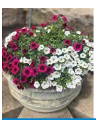
Beautiful flowers that were placed at Ss. Peter & Paul Church on Helping Hands Day.