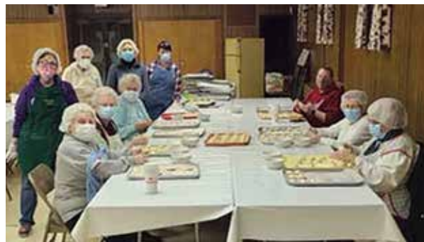
A few of the many volunteers who worked to make dough, prepare filling and pinch the pirohi.

laughter and camaraderie, while raising necessary funds for the upkeep at St. John. Thank you to all those who volunteered, to those who purchased