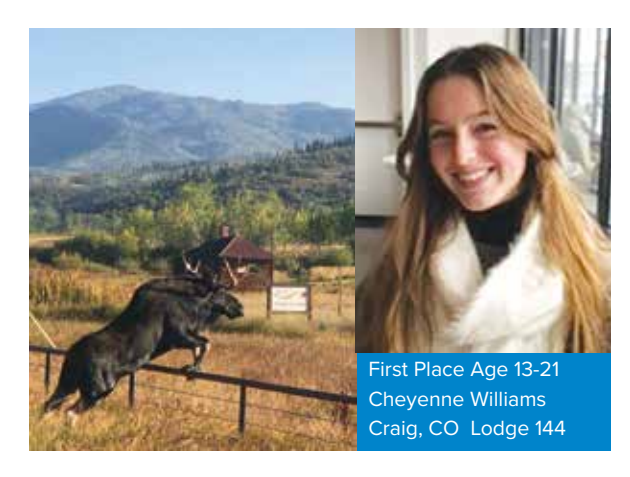
I live an hour from my school, each day is the most beautiful, sometimes funny, vacation that I get to live everyday. I always see cool things, for example, this huge bull moose up close and personal!!