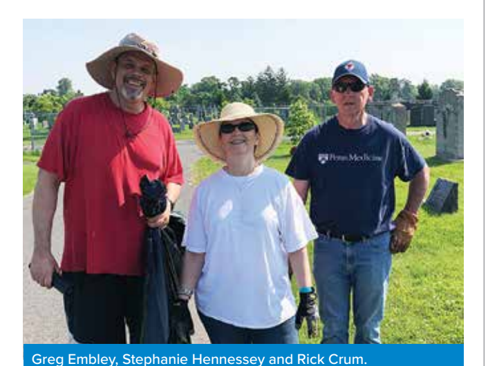
Lodge 15 TRENTON, NJ