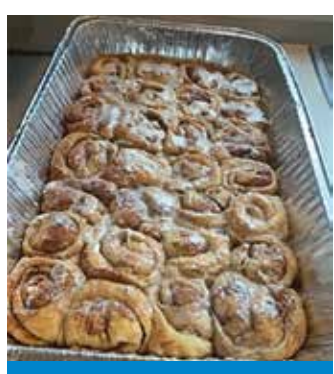
The Andre House cinnamon rolls!