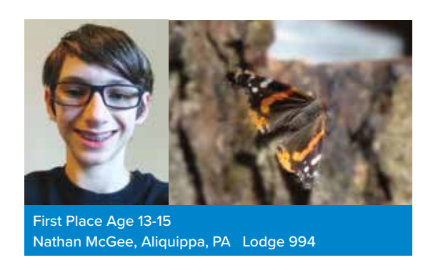
My photo is of a Painted Lady. In my spare time, I have fun by looking for insects and learning more about the ecosystem.