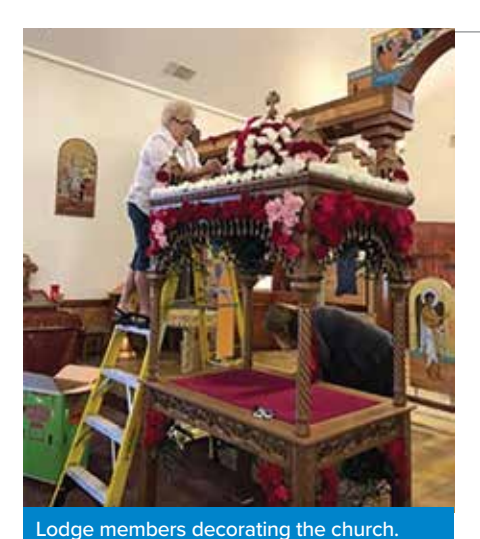
Lodge 999 PHOENIX, AZ