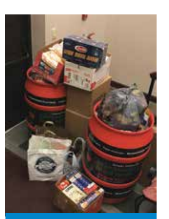
Food Bank collection.

Duquesne, PA. SS. Peter & Paul Church held a food drive for the Greater Pittsburgh Community Food Bank along with Lodge 2 of St. John Cathedral in Munhall, PA.