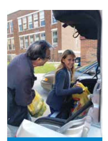
Packing food items to be taken to the Euclid Hunger Center.