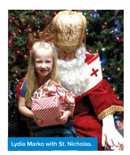
Lodge 53 WILKES-BARRE, PA