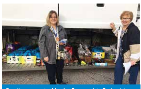
Goodies are packed for the Presque Isle Casino trip.