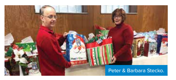
Lodge 390 MCKEES ROCKS, PA