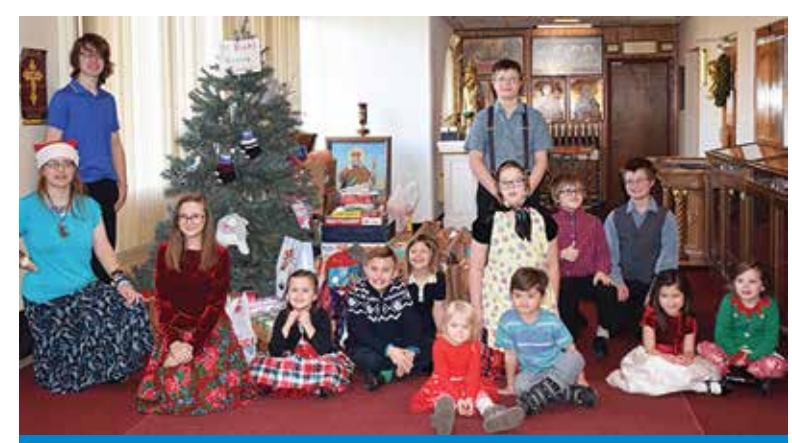
The children from the ECF program at St. Nicholas Church in front of their Giving Tree.

The Giving Tree project culminated on Sunday, December 16, 2018, and was recognized at the annual ECF Christmas Play and Pizza Party