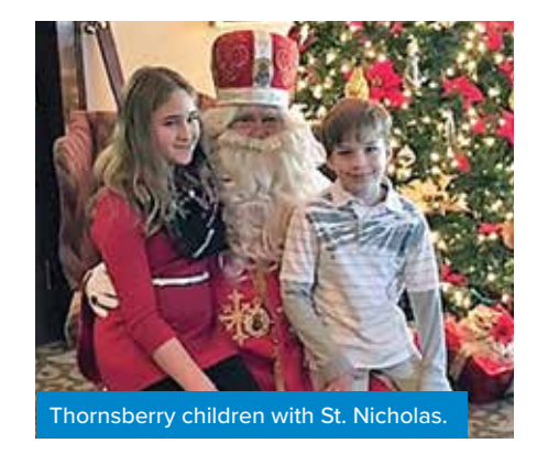
Lodge 302 BRECKSVILLE, OH