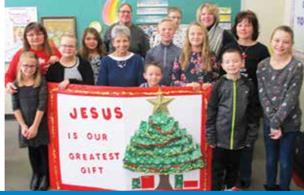
Teachers with ECF students at the St. Nicholas program.