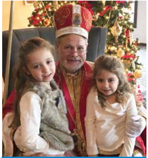
St. Nicholas greets parish children.