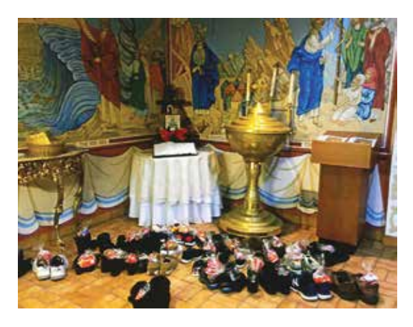
Lodge 319 FLUSHING, MI