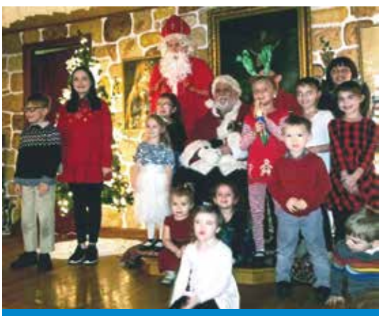
St. Nicholas and Santa Claus join together to make Christmas brunch fun for the children.