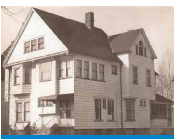
First Convent-Holy Ghost in Cleveland, OH