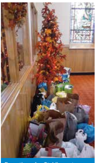
Donations for St. Vincent de Paul Soup Kitchen.