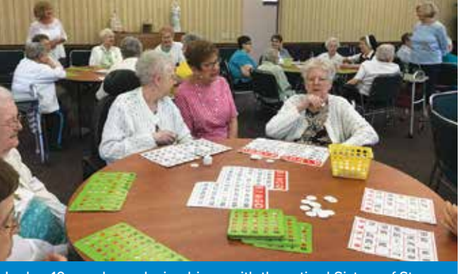
Lodge 10 members playing bingo with the retired Sisters of St. Joseph Mother House in Baden, PA.

At the conclusion of the weekend sale, St. George Church realized a profit of over $2,000.00.