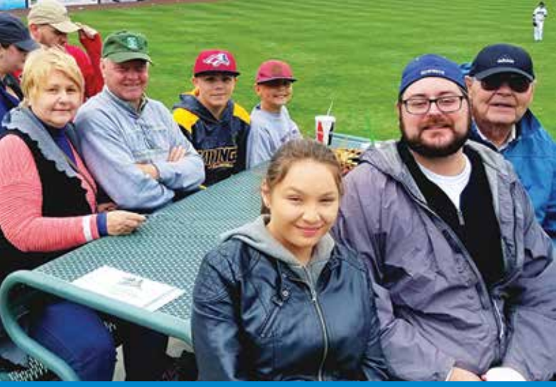
District 7 baseball fans enjoying the game despite the inclement weather.

A Day at TD Bank Ballpark | Forty members of District 7 with their family and friends came out to TD Bank Ballpark in Bridgewater, NJ on Sunday, June 3, 2018. The home team Somerset Patriots played the Road Warriors. The ballpark also held an Asian-American Festival that day. There was a very colorful show with performing dragons. Everyone enjoyed a BBQ lunch. The outing was assisted financially with a Fraternal Grant from the GCU Home Office. The district invited youth under eighteen years of age to come out to the ball game free of charge. The rainy day didn't discourage everyone from having a great time.