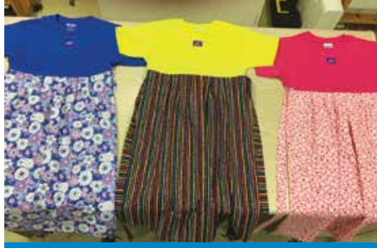
A few of the dresses that were made to be donated to the Dress a Girl Around the World.

then "hand-carry" the dresses and slip them over the tattered clothing of the girls. They just "beam" when they receive their new garments.