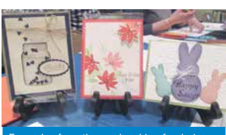
Examples from the card making fundraiser.