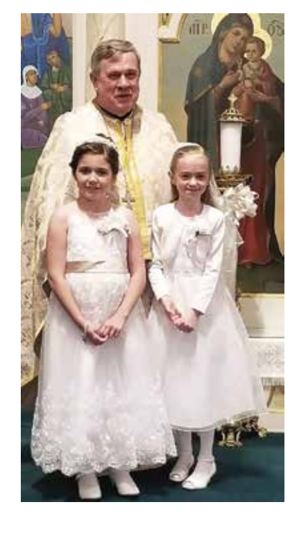
Lodge 92 JESSUP, PA