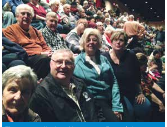
The group at Westbury Manor to see Funny Girl.