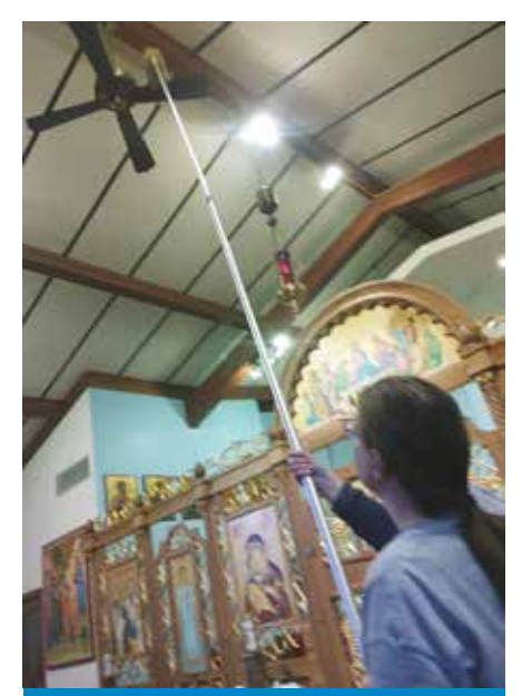
Cindy Dinsmore maneuvers an extension pole to dust high wooden arches and ceiling fans in the interior of St. Nicholas Church.

Following the luncheon, children of the parish and lodge went outside to hunt for and collect toy-filled plastic eggs hidden on the parish grounds by the Easter Bunny!