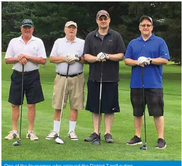
One of the foursomes who enjoyed the District 7 golf outing.