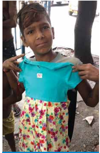
A girl from India shows one of the GoGive! funded dresses.