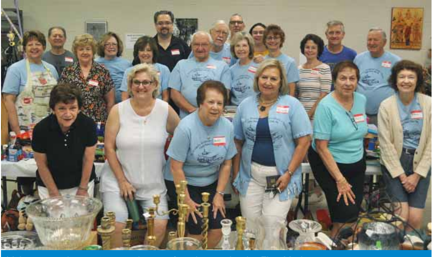
Volunteers who put in many hours of work to make the Flea Market a success