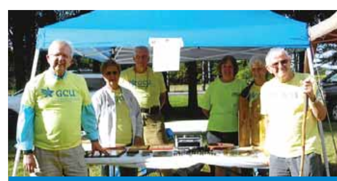
Cultural items, icons and religious items on display at the Heritage Festival.

Lodge 93 sponsored two booths at the first ever Cambria County Arts & Heritage Festival held at Duman Lake County Park, Nicktown, PA. One booth displayed cultural & religious items of the Byzantine Rite and the other had pamphlets on the Eastern Church and promotional items from the GCU. There was a drawing to benefit the roof project at St. John's Byzantine Church in N. Cambria. Many activities included local bands providing music, speeches from the local representatives, food, arts & crafts, a Civil War reenactment, a medieval fair, a dance group, a juggler, a magician and Star Wars storm troopers. All had a good day and hope everyone comes back next year.