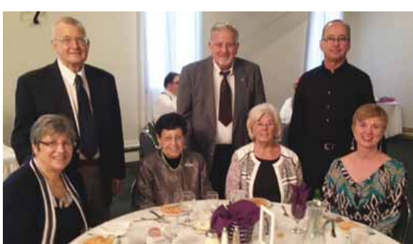
Lodge members enjoying the 50<sup>th</sup> Anniversary at St. Nicholas of Myra Church.