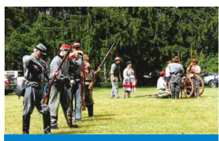
Civil War reenactment during the Festival.