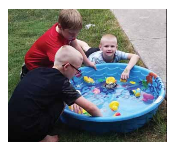
Lodge 77 LORAIN, OH