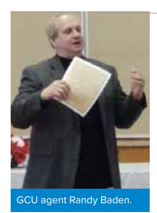
Lodge 336 EUCLID, OH

To date, $23,000.00 in scholarships have been awarded: $2.500.00 donated to Notre Dame's science lab upgrades and $3,100.00 was donated to the Immune Deficiency Foundation for education and research.