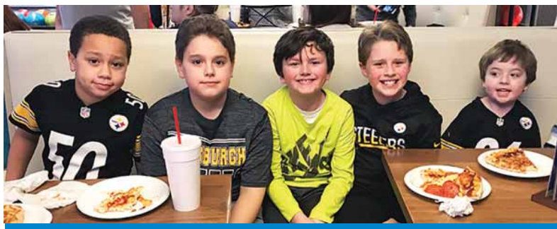
A few of the kids who enjoyed the After Christmas Party at The Main Event.