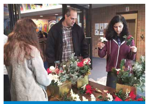
Lodge members work together to decorate the Church.