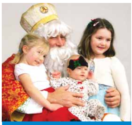
St. Nicholas with the children.