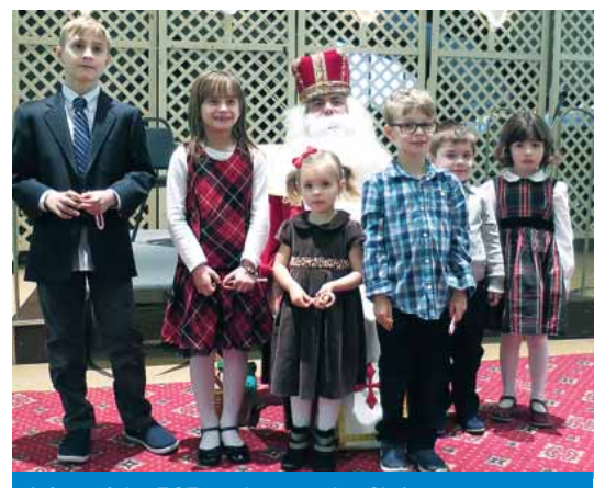
A few of the ECF students at the Christmas events