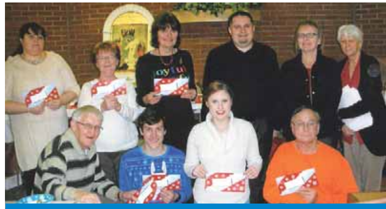
Parish and lodge members at the Recognition Dinner.