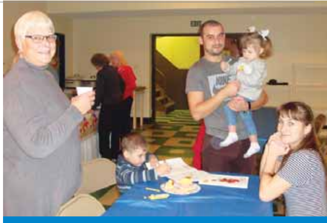
One of the families who enjoyed the Holiday Social.