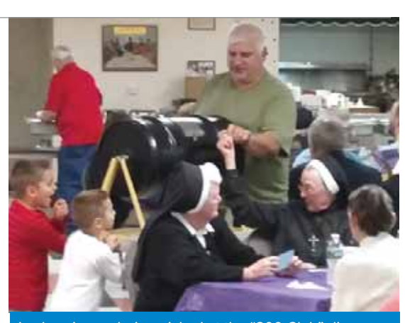
Lucky winners being picked at the "300 Club" dinner.