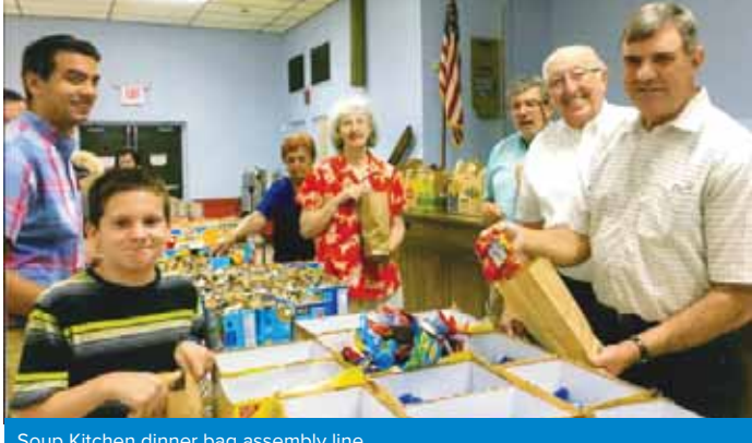
Soup Kitchen dinner bag assembly line