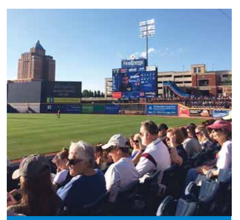
Lodge 302 members at the Akron Rubber Ducks baseball game.